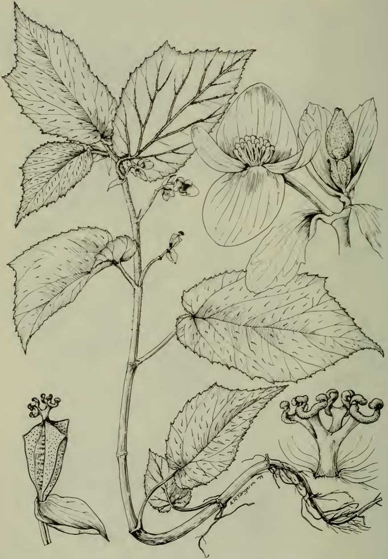
Begonia harlingii L. B. Smith & Wasshausen